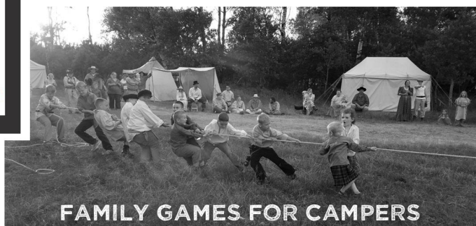
FAMILY GAMES FOR CAMPERS